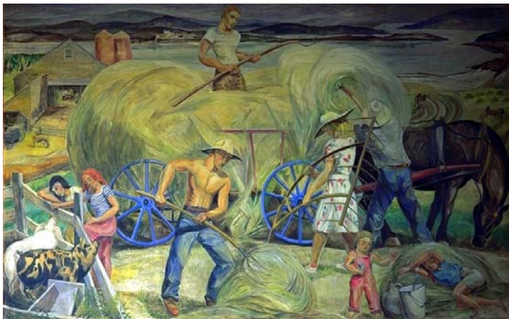
WPA Art – Artistic works commissioned by the Works Progress Administration, designed to give jobs to artists willing to create works for public consumption; emphasized classic American values of hard work and ingenuity; example shown is Hay Making by Marguerite Zorach.