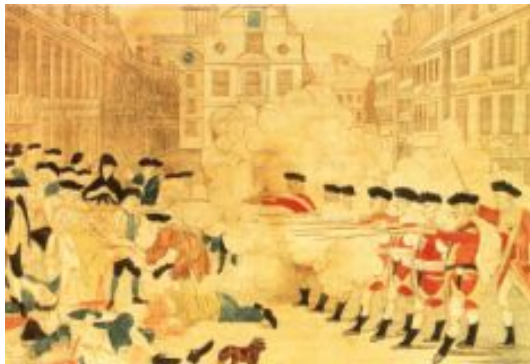
Paul Revere – One of the Sons of Liberty; published a rabble-rousing but historically dubious account of the Boston Massacre.