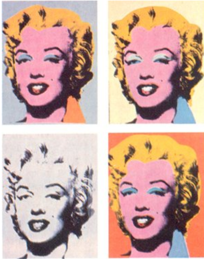
Andy Warhol – Greatest of the pop artists; used the mass production technique of silk-screening to produce and reproduce images; commented on fame, consumerism, identity, and conformity.