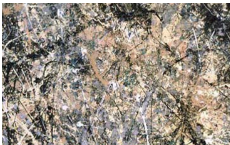
Jackson Pollock – Greatest of the American abstract expressionists; artwork is non-representational and often involves dripping paint on canvas for effect.