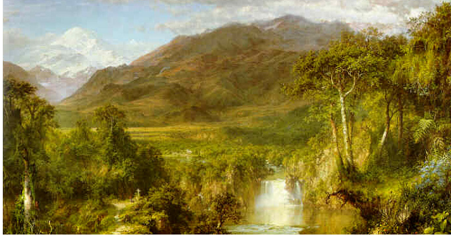
Hudson River School – Distinctly American movement in art in the mid-19 th century; focused on large landscapes and natural settings; artists included Thomas Cole and Frederic Edwin Church.