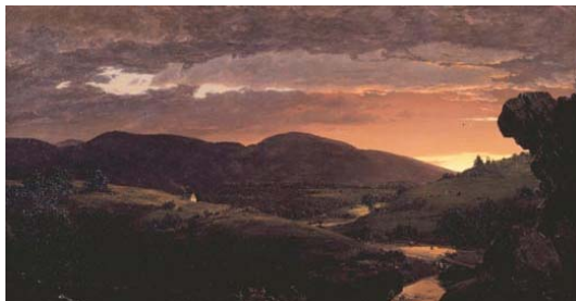
Frederic Edwin Church – Famous painter of the mid-19 th century; part of the Hudson River School; specialized in large landscapes depicting the unspoiled beauty of the wilderness; believed in manifest destiny and westward migration.