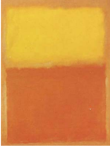
Mark Rothko – Another famous abstract expressionist; often used bright colors and geometric shapes to influence tone and mood; example shown is Orange & Yellow .