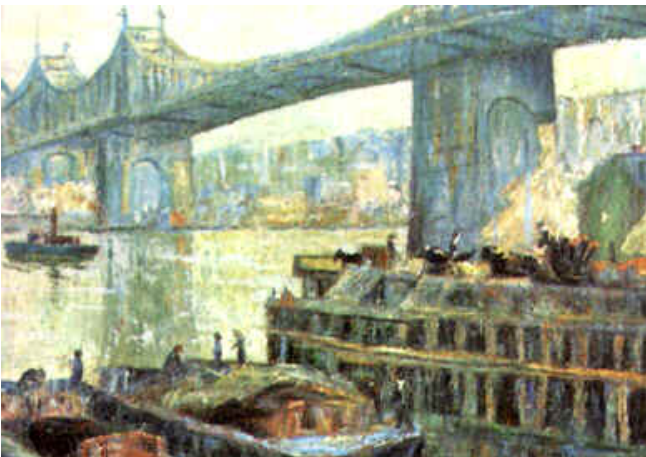
Ashcan School – New York movement in the early 20 th century in which artists sought to depict the emotional realities of urban life; example shown is Queensborough Bridge by Ernest Lawson.