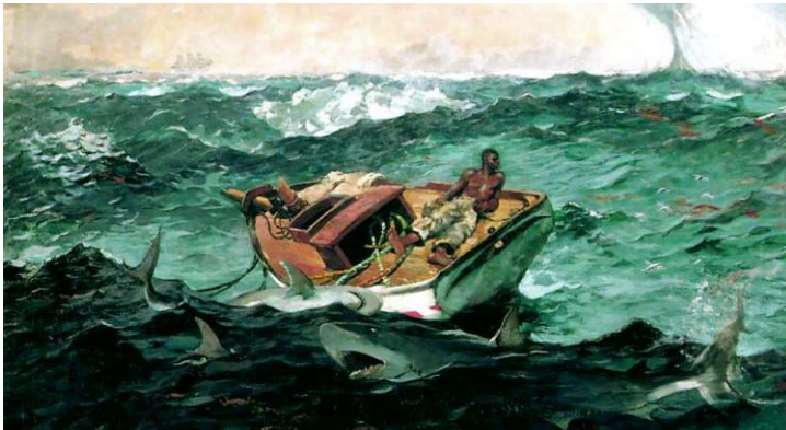
Winslow Homer – Another realist of the post-bellum period; focused on making the painted image as close as possible to reality; most famous work is Gulf Stream , depicting a black sailor in boat surrounded by sharks.