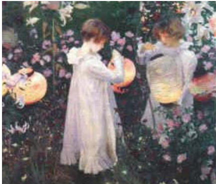
John Singer Sargent – Outgrowth and reaction to the realist movement; added elements of nature and Impressionism in his works; example shown is Carnation, Lily, Lily, Rose .