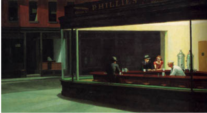
Edward Hopper – A realist of the early 20 th century; focused on distinctly American images of society; subjects included loneliness and isolation; most famous work is Nighthawks .