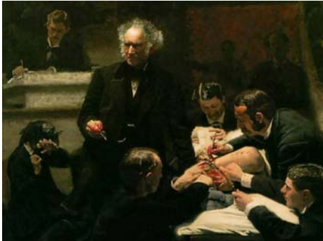
Thomas Eakins – Realist painter of the post-bellum period; contemporary and friend of Walt Whitman; focused on the ordinary; most famous work is The Gross Clinic .