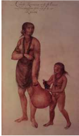
John White – Leader of the lost colony at Roanoke; his pictures of Native Americans and vegetation convinced many to invest in or settle in Virginia colony.