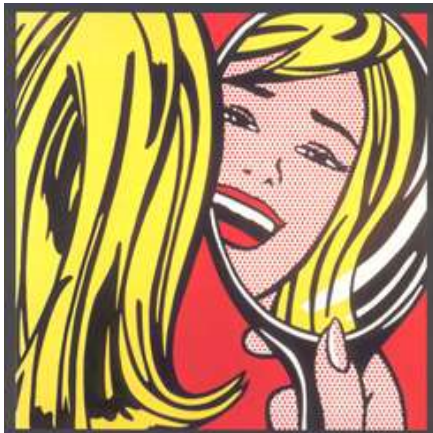
Roy Lichtenstein – Pop artist who used fanciful comic strips to comment on mass consumerism and conspicuous consumption.