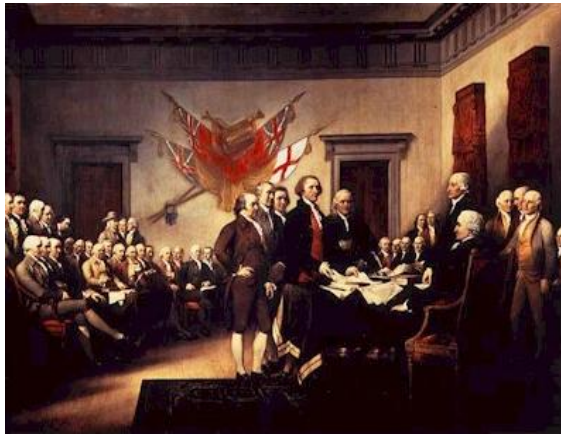
John Trumbull – First great American nationalist painter; painted battle scenes and portraits depicting Americans as heroic and noble.