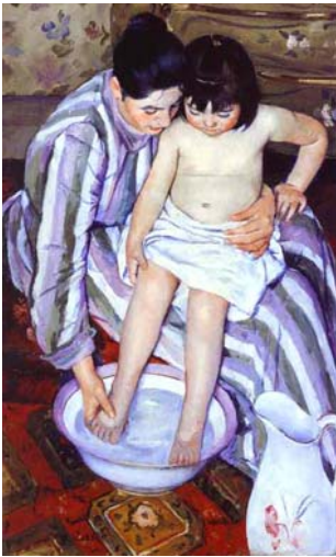
Mary Cassatt – Considered one of the finest painters of the 19 th century; Cassatt's work was largely overlooked in her country and time; part of the realist movement but with shades of Impressionism.