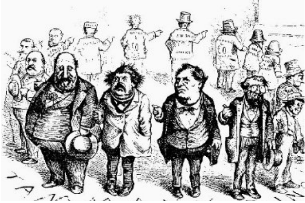
Thomas Nast – Artist of the Gilded Age; famous for his cartoons depicting corporate greed and excess; also created the enduring image of St. Nicholas.